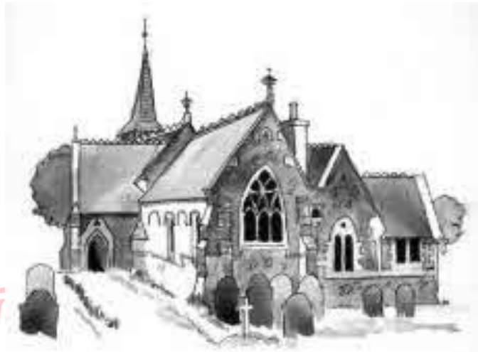
Our local church is St Peter's in Woolhampton.

As a church school at the heart of the village community, Christian values underpin our work, our relationships and our commitment to ensure equality of opportunity for all pupils. We will strive to make our school welcoming, open and friendly with a positive Christian ethos where the views of the children and parents are valued.